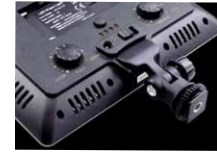
1/4"-20 Female Thread

LED Lamp qty:384pcs Input Voltage:15V Power Consumption:45W Color temperature:3200°K-5600°K CRI≥95 Luminance:4250LM Illuminating angle:120° Power supply mode:Lith LT-F550/770/970 or AC power with Adapter Dimension:250x350x42mm Weight:0.82Kg