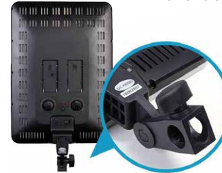
Angle adjust and lock nut